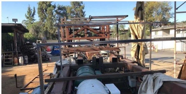
Driveway Path Front to house