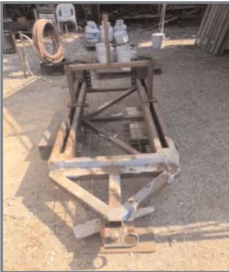
Old Front end