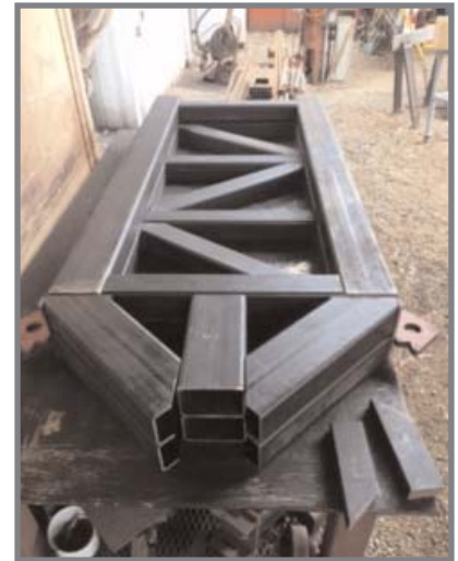
New Front end in progress

These pictures show the progress of having pulled the old front-end off, and the ongoing nearly completed new front-end. (thank goodness we have forklifts!)