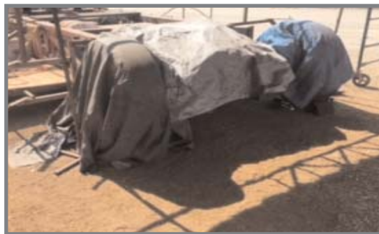
Front end goes here!

These pictures show the progress of having pulled the old front-end off, and the ongoing nearly completed new front-end. (thank goodness we have forklifts!)