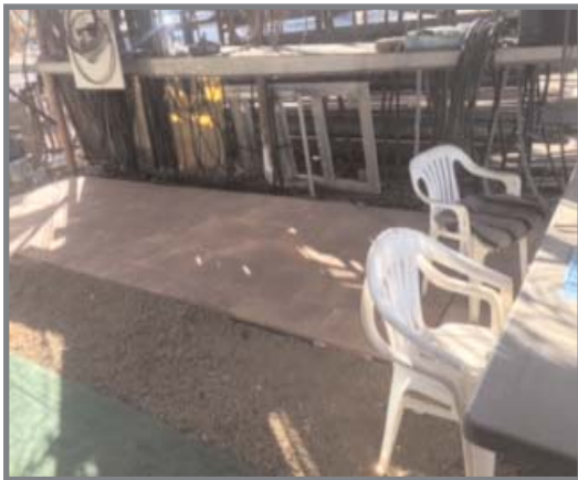
New "patio" area prepared for safe-distance workstations

Float: Work is complete, as mentioned above, on the new Front end. Next Phase is to move on to tackling similar compliance mandated upgrade to the back end. Along with that we continue to process the extensive hydraulic hose replacement project. This project will in all likelihood be too costly to complete in a single year. The plan is to defer costs over a multi-year plan where we can raise dedicated funds with achievable targets. As such we are looking to identify hose priority to avert any en-route "surprises" as we execute this deferred timetable.