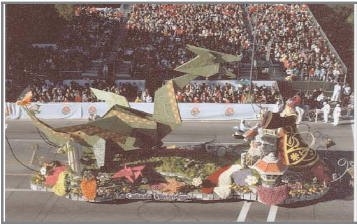
Scissored Wizard -- 2009

In 1923, Coco Chanel told Harper's Bazaar that "Simplicity is the keynote of all true elegance."