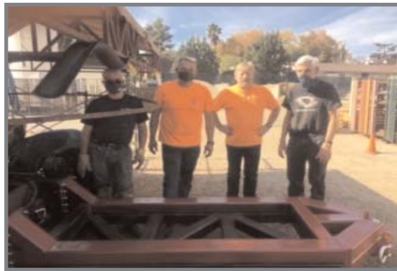
Front end installed!