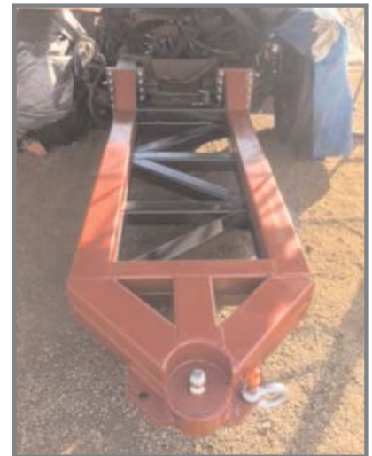
New Front end... shiny !

Site: Site has a newly laid "patio" area behind the main desk. This is set up for concurrent mobile workstations for safe distancing build work. Additionally making use of more of our covered areas to allow work in less desirable hot/rainy weather(!) - though you know, nothing stops us!